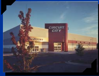
Circuit City Winston-Salem, NC