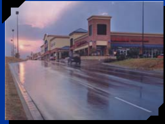
Jackson Plaza Cookeville, TN