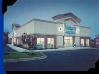
Kinko's Greenville, SC