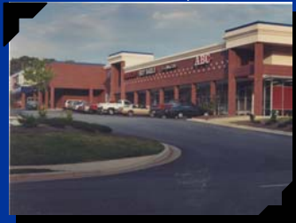
Wendover Square High Point, NC