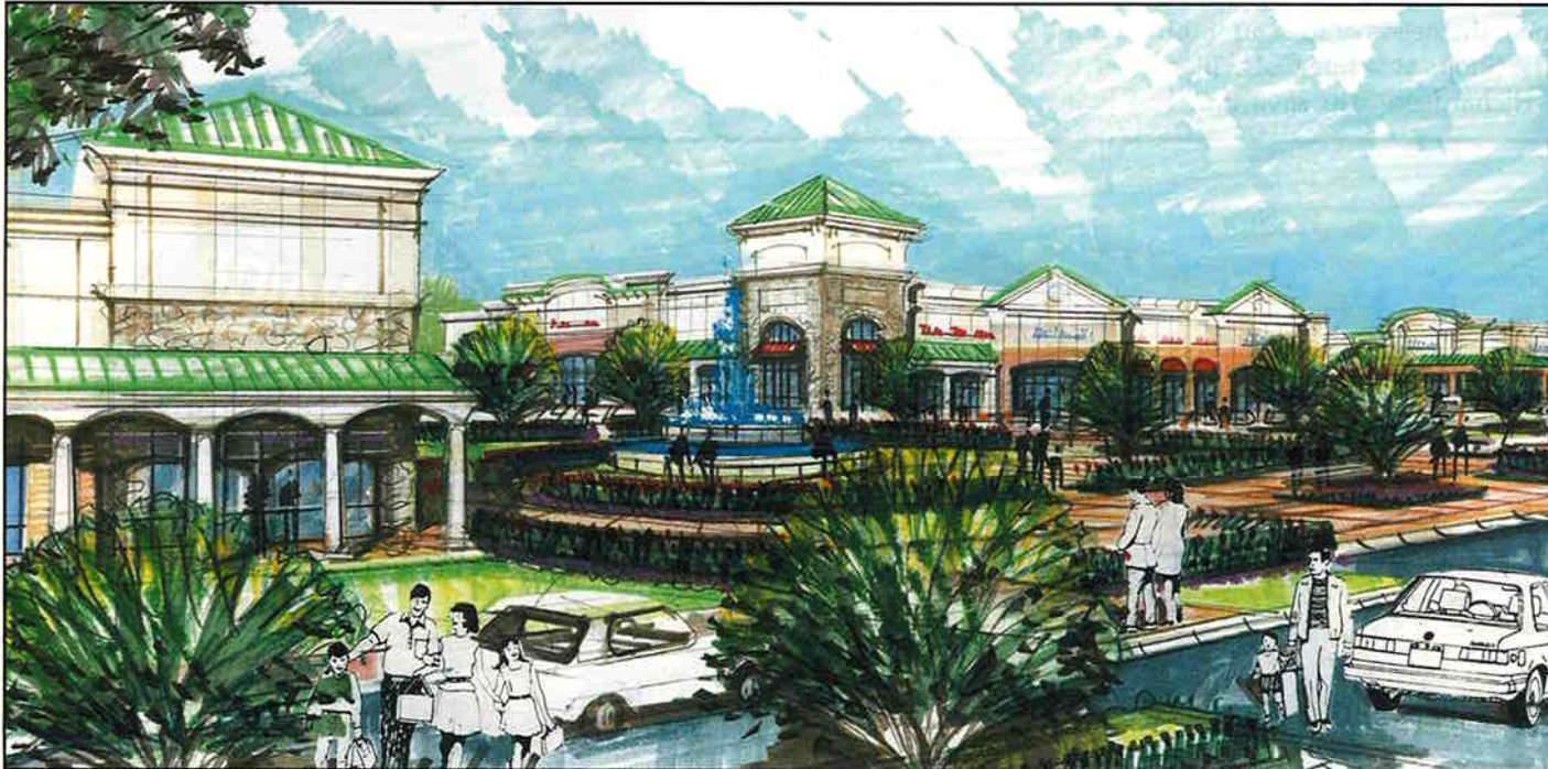
The Goodman Company's Landstown Commons in Virginia Beach, Va., broke ground last year and will partially open this month.