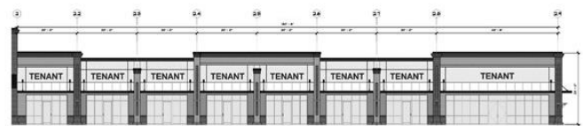
2 SHOPS FRONT ELEVATION SCALE: 1/8" = 1'-0"